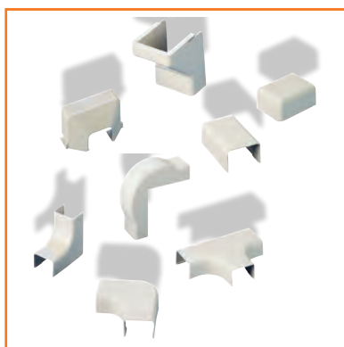
Surface Raceway Accessories