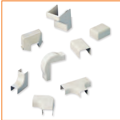
Surface Raceway Accessories