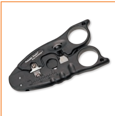
Data SureStrip Cable Stripper