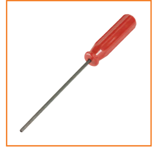
Booth Wrench Security Tool