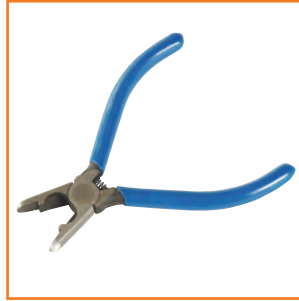
Discrete Connector Presser Plier