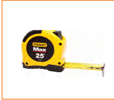
Maxsteel Tape Measure - 25-Feet