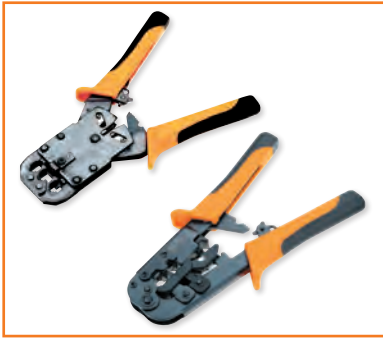
Ratcheting Crimp Tool