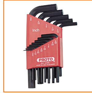
Hex Key with Molded Plastic Holder