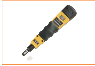
Punch Down Tool with 66 Blade

Punch down tool and accessories are for terminating wires onto 110 and 66 type IDC connections.