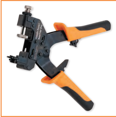
Coaxial Compression Crimp Tool