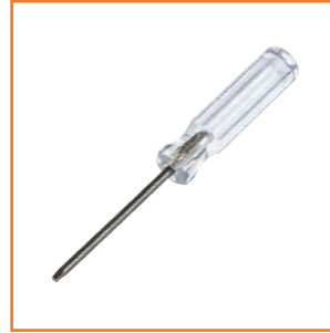
No. 3 Square Tipped Driver