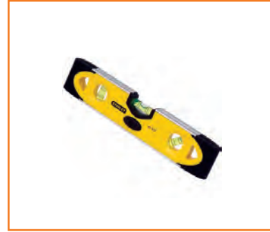
9-Inch Magnetic Torpedo-Style Level