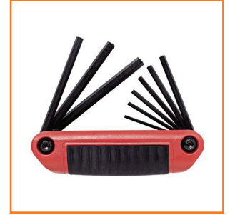
Folding Hex Key - 9 Pc.