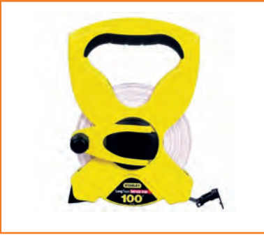
Open Fiberglass Tape Measure - 100-Feet