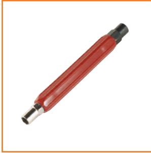
Terminal Can Wrench