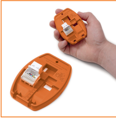
PREMIER Hand Held Termination Tool

Punch down tool and accessories are for terminating wires onto 110 and 66 type IDC connections.