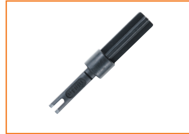
Replacement Double 110 Blade