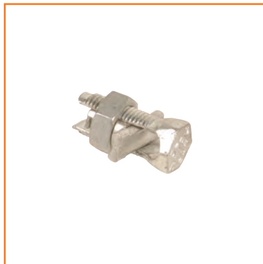
Tin Plated Split Bolt w/ spacer for 2 conductors