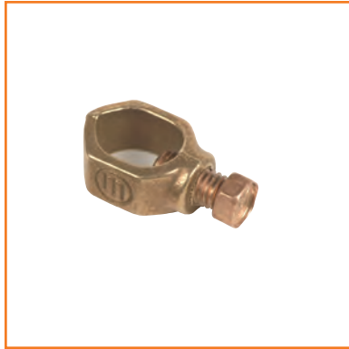
Bronze Ground Rod Clamp