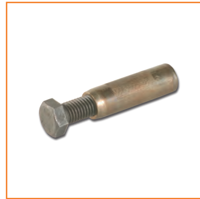
Ground Rod Coupling Threaded with Driving Stud