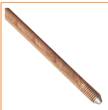
Sectional Threaded Rods