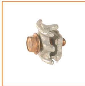
KUL Bonding Clamp