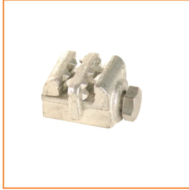
Tinned Bronze Vise Grip Connector