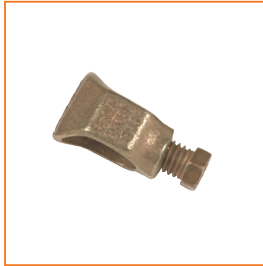
Heavy Duty Bronze Ground Rod Clamp