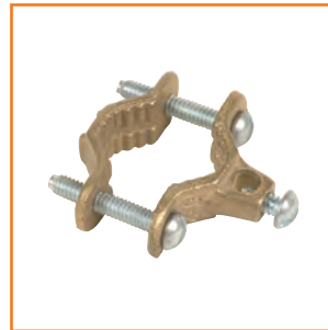
Bronze Ground Pipe Clamp