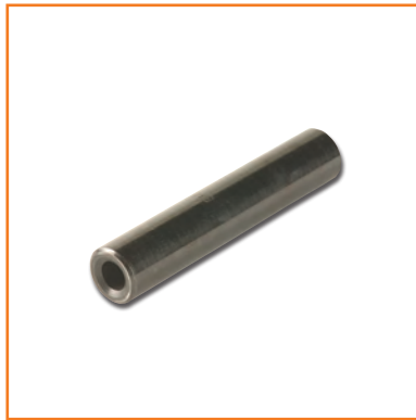
Ground Rod Drive Cap