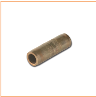
Ground Rod Coupling Threadless